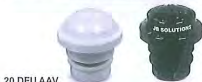
20 DFU AAV