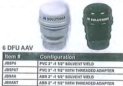
6 DFU AAV